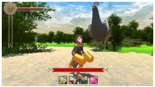
Fig. 2: Tina fighting the Shy Peacock boss

Each beasts have their own moves and attack patterns making the game more challenging for the player. For example: Shy Peacock (see Fig. 2) has the power to use his agility to invade and continuously attack the player.