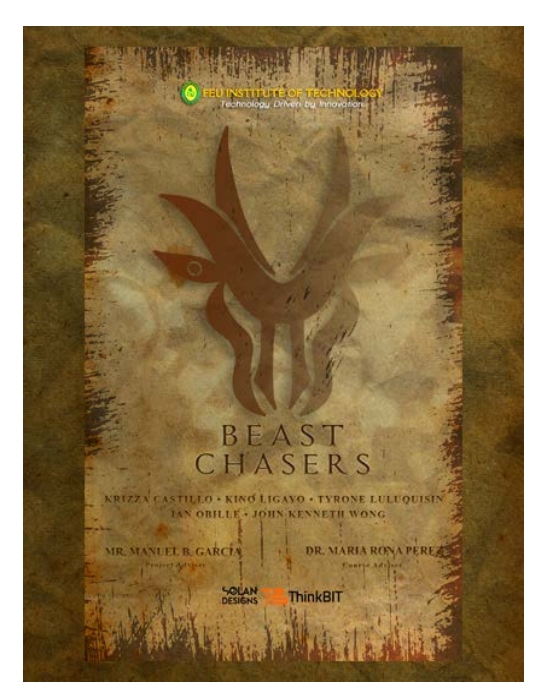
Fig. 1: Official Beast Chasers Poster